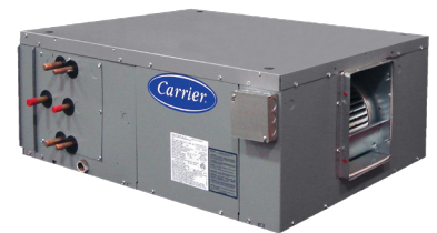
Constant Volume AHU